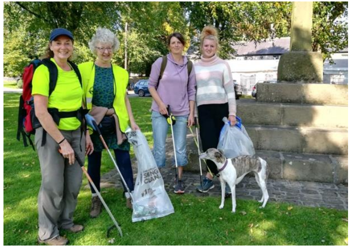
Our Litton team are all geared-up (with help from a four-legged friend)

On 13 June 2021, we will be joining this year's Great British Spring Clean 'million mile mission', by litter picking in our local area, and working together to keep our villages safe and tidy. We are also delighted that we will be joined on that day by members of the Climate Pathfinders Youth Forum.