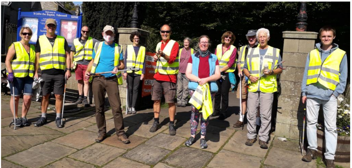
The Tideswell team raring to go!