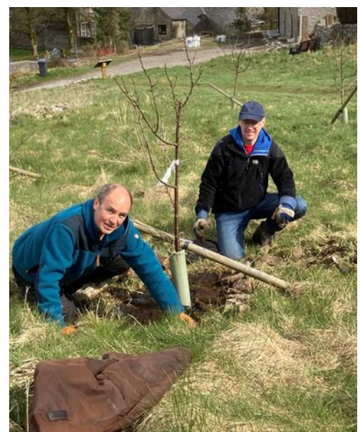
CAG members at the Community Orchard