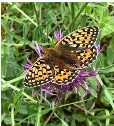
Green fritillary butterfly (Alison Rooke)