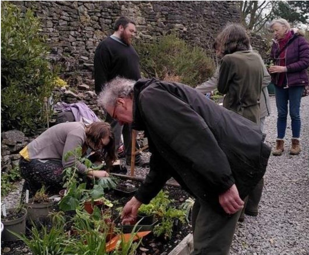
TDEG Plant and Seed Swap – Tideswell Kitchen Garden (May 2021)

This is Tideswell & District Environment Group's (TDEG) second annual report, covering the period June 2020- June 2021. There is some `official` information in here, but this is mainly a celebration of the activities of the group over the last twelve months, and a thank you to everyone who has contributed to our activities and supported us over the year.